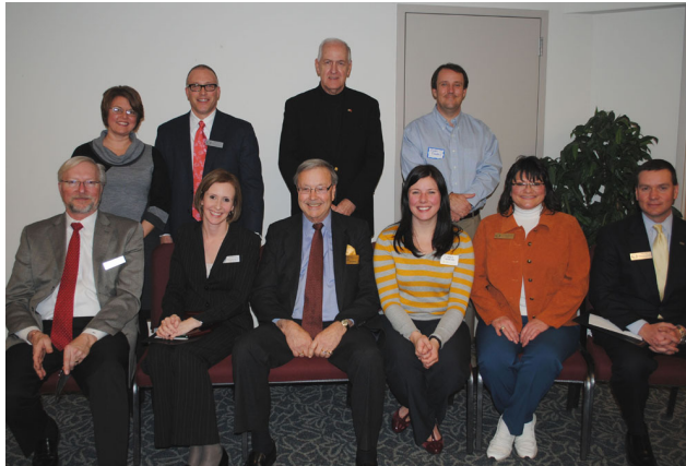
Thank you to our 2011 Board of Directors for a wonderful year!